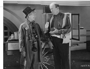
The DUCK SOUP film benefit at the Golden State Theatre was lots of fun. Look for upcoming information on future events.